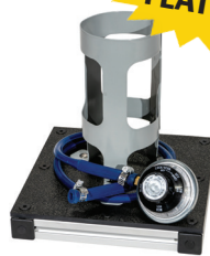
New Propane Canister Holder included with TU-502