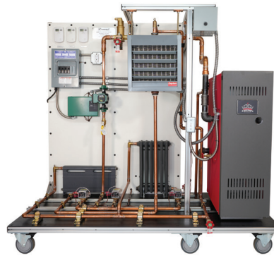
TU-210G Gas boiler option

CUSTOMERS HAVE THE CHOICE OF EITHER: Gas or Electric Boiler