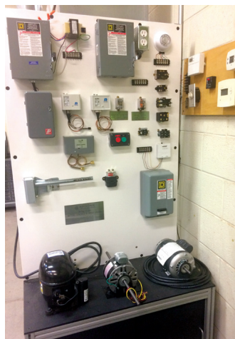
Example of lay-out build-up.